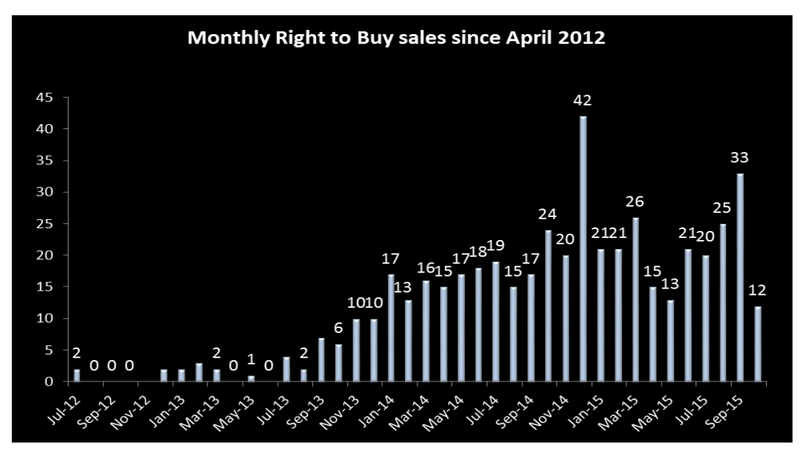
Graph 1 – 480 Right to Buy sales have taken place since April 2012